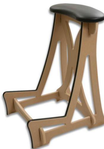
The Fully Assembled Stand:

Once everything is aligned, push down firmly to fully seat the brace/seat assembly. The stand/stool will become rock solid.