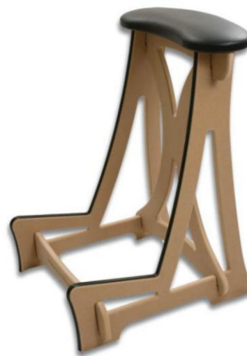
The Fully Assembled Stand:

Assemble each side piece by rotating it up into the cross piece notch.